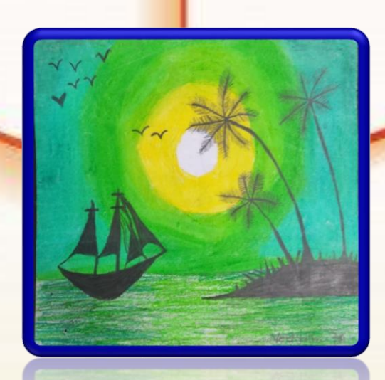
Veekshitha - VII A