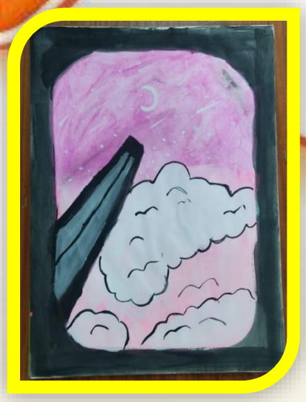
Ilina - VII B