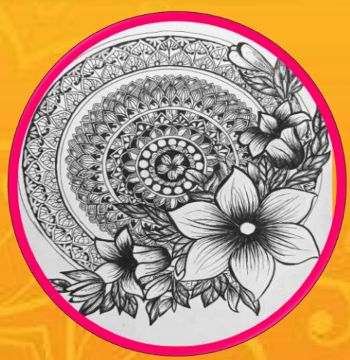
Gokshetra -IX A