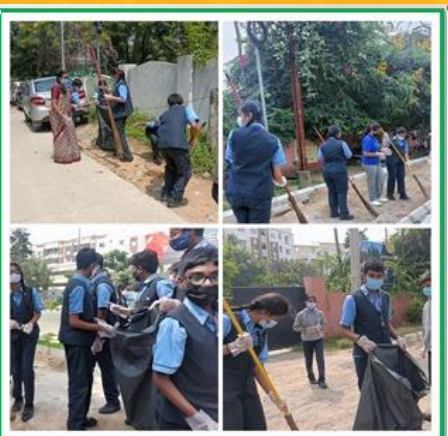
Ek Tareekh Ek Ghanta-Shramdaan activities (After Drive)