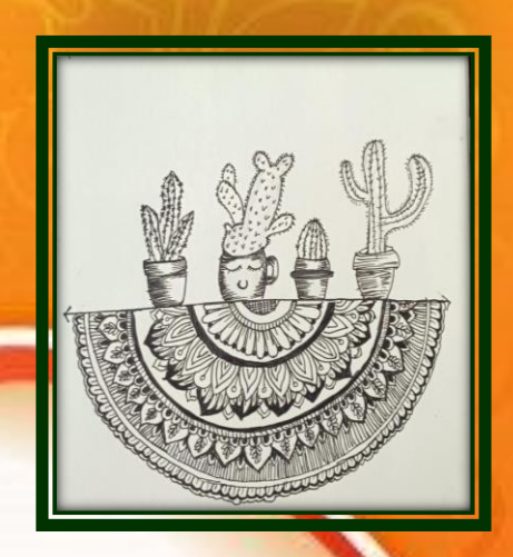
Uma - IX A