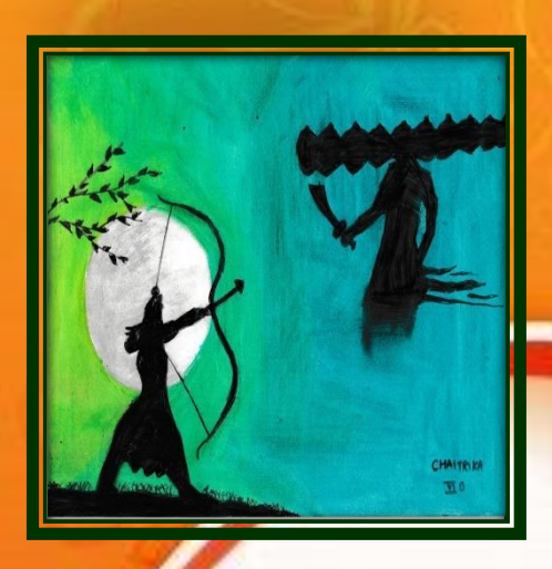
Chaitrika - VI B