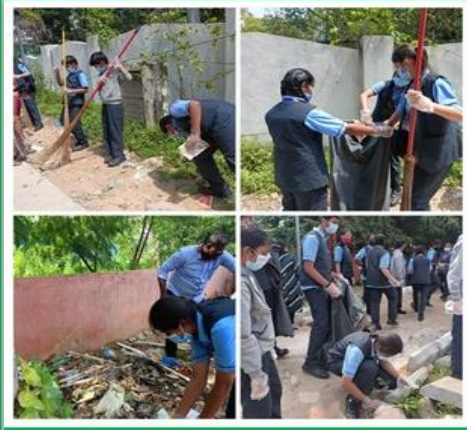
Ek Tareekh Ek Ghanta-Shramdaan activities (Students on Drive)

A Pledge for a Cleaner Tomorrow: "Ek Tareekh Ek Ghanta Cleanliness Programme"