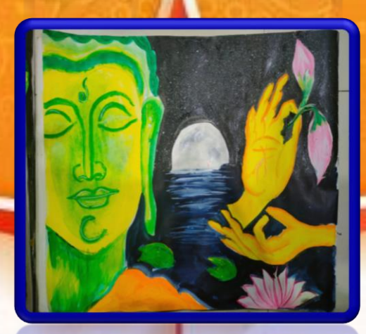
Saketh - VIII A